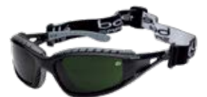
1652017 • Shade 5 Lens