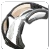
Accessories: 1652015 • Rx Adaptor