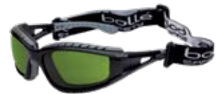
1652016 • Shade 3 Lens